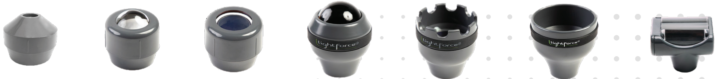
Small Cone Small Massage Ball Flat Window Large Massage Ball Large Cone XL Cone Rolling Pin