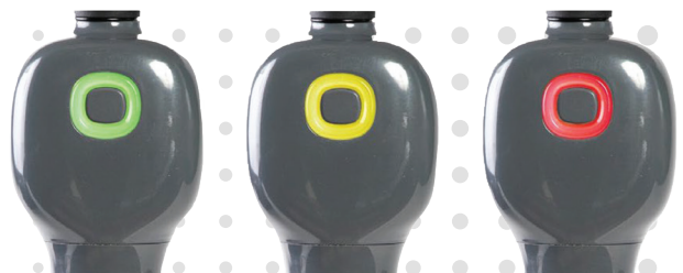
Recommended Speed Speed too fast Speed too slow

Built-in dosing feedback technology with embedded finger switch and indicator lights. In order to achieve effective treatments and improve dosing accuracy, the Smart Handpiece assesses the operator’s speed and gives real-time visual and sensory feedback. The Smart Handpiece is ergonomically styled for operator comfort.