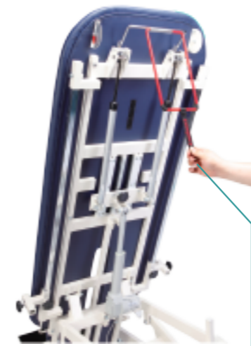
1-Pull Emergency Handle