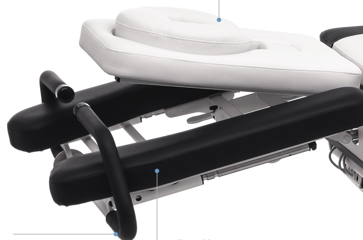
Foldaway grab bar