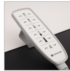
Intuitive remote hand control for all moving parts