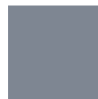
Graphite Grey (x = 07)