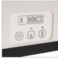
Table controls regulate both heating and lighting functions