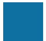
Blue (x = 02)