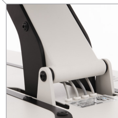
Integrated cable and power cord system