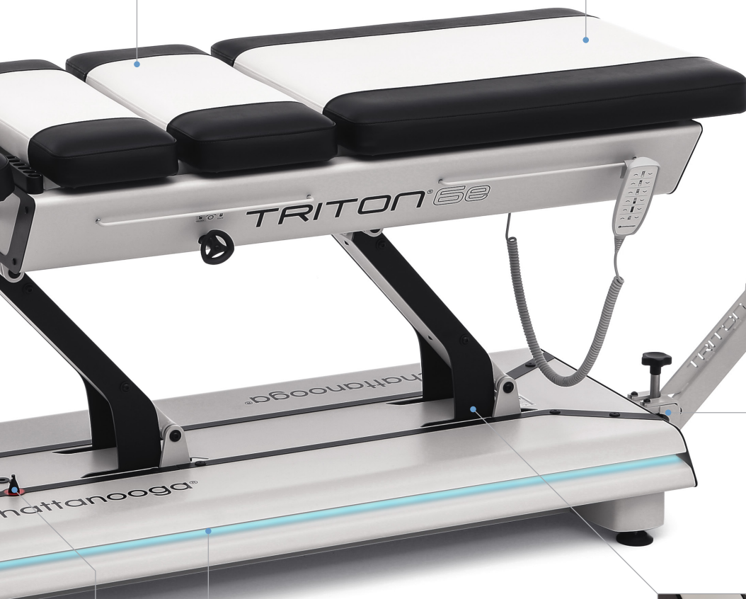
Pivoting traction mount