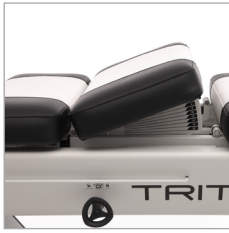
Pelvic tilt section (0° to 20°)