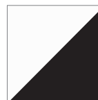
Black/Ecru (x = 10)